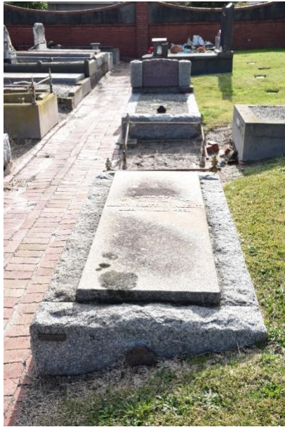
(above) Gravesite of Olive Selover (Ind "B" 5)