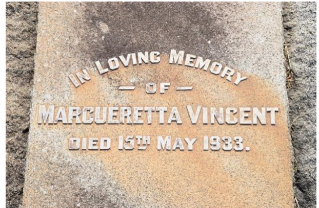
(above) Inscription: "In loving memory / - of - / Margueretta Vincent / died 15th May 1933."